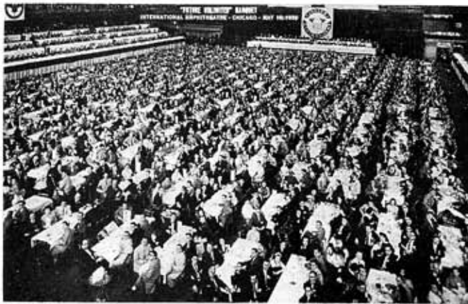
Junior Achievement Banquet, Chicago.

East African Wild Life Society. They also participate in similar American organizations.