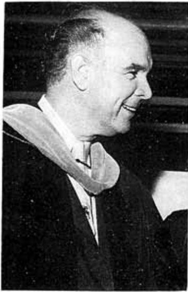
Commencement Speaker, Florida State University