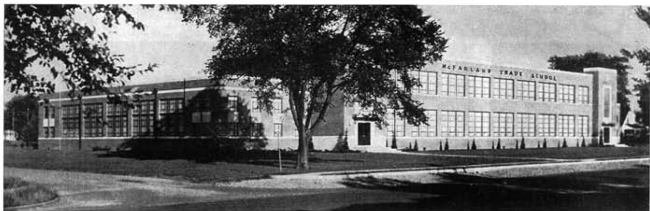
The McFarland Trade School, Coffeyville, Kansas.